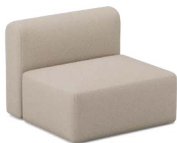
97E | 96 x 97 cm