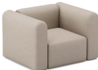
A1H | 123 x 97 cm