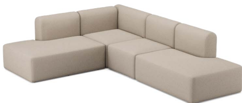
F3H | 296 x 224 cm