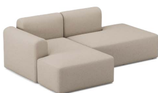
E1L | 224 x 152 cm