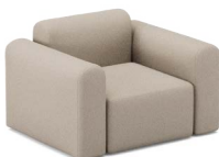
A1L | 123 x 97 cm