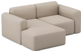
C1L | 194 x 152 cm