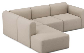
M1L | 266 x 224 cm