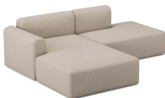
E3L | 247 x 188 cm