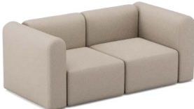
A2H | 194 x 97 cm